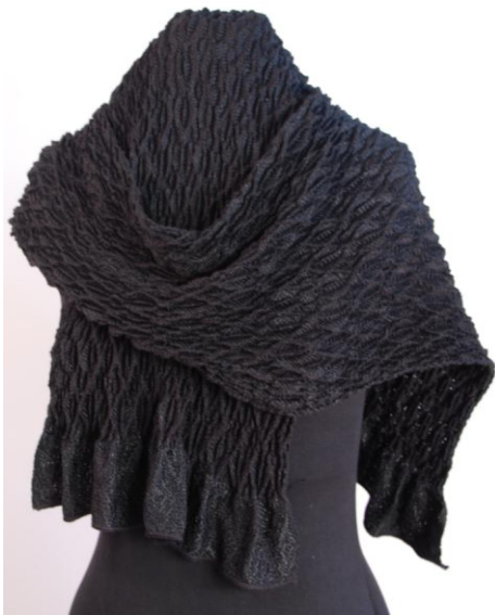
Weft crimp, 8S Twill threading 2/8 merino, 8/2 polyester

Experience the magic of crimp cloth! Any fiber can be used for crimp cloth when orlon or polyester is used in the weft for weft crimp, or in the warp for warp crimp. Learn the technique/thought process through sampling in class. See why crimp cloth is a great stash-buster. Go home with your head filled with ideas to make easy-to-sew garments that flatter any figure. Only 6 seams and you have a vest. Shawls and scarves won't fall off your shoulders and can be expanded to cover chilly arms when needed. If you can warp a loom and read a draft you can learn to weave crimp. (Above left: student sample.)