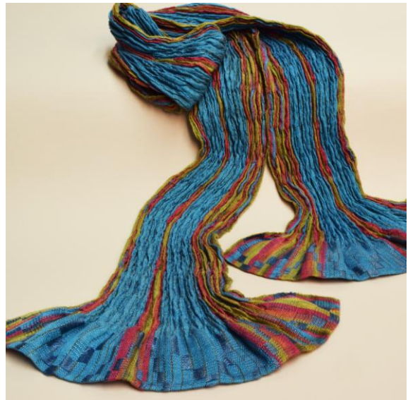
Weft crimp, 4S Overshot threading 10/2 rayon, Giovanni Verbena polyester