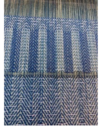
Weft crimp, 10/2 overdyed cotton warp, 8/2 Orlec weft