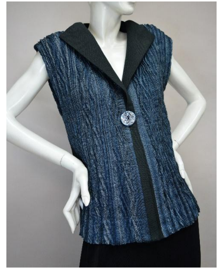
Warp Crimp, 10/2 cotton, 8/2 polyester