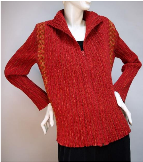
Weft Crimp, 10/2 Cotton, 8/2 polyester