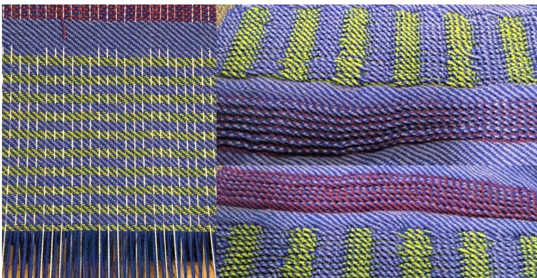
Above and below: Warp crimp, on-loom and processed samples, 8S 8/2 polyester warp, cotton weft, both samples. (Above: student sample)