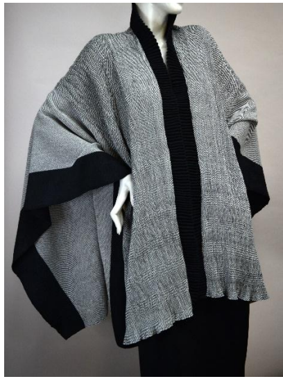
Weft Crimp, 2/18 Merino, 8/2 polyester