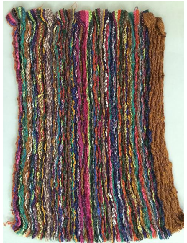
Stash-busting! Before and after processing. Weft crimp. (Student sample.)